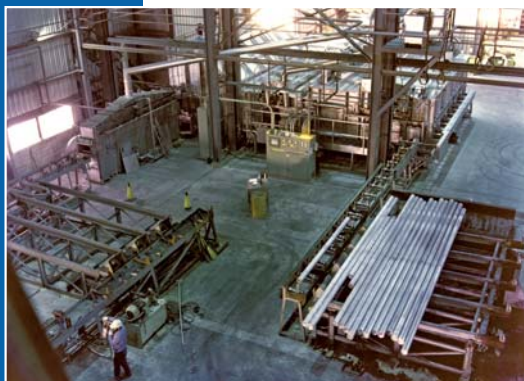
Continuous operating system