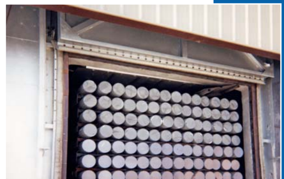
Movable baffle (lowered position)

These chambers are designed to cool the load uniformly to your specifications. Loads are usually plunge cooled at rates that can approach 700°F/hr in the initial stages of the cycle. The cooling rate can also be controlled using variable-speed cooling fans.