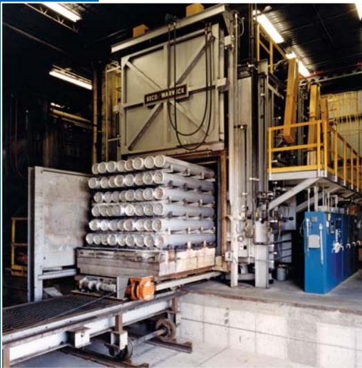
Batch-style furnace with car

SECO/WARWICK manufactures custom-engineered aluminum log and billet homogenizing furnaces for most process applications. Equipment designs include batch types (both car and tray designs), traveling styles and continuous styles, complete with material handling systems and load cooling equipment. Unique reversing airflow designs and temperature control systems produce fast heating rates with close temperature uniformity throughout the entire load.