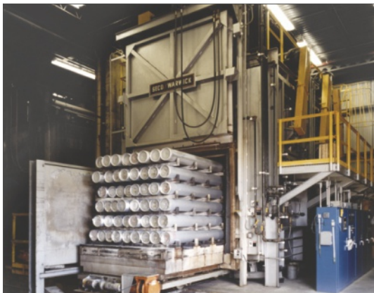
Batch style furnace with car

The patented reversing airflow design with upstream/downstream temperature control using an axial flow fan wheel reverses rotation on a timed basis, which, in turn, reverses the direction of the horizontal airflow through the load. The air stream temperature is monitored and controlled on each side of the load. A thermal head is used during the early stages of the cycle for fast, efficient heating. This design increases both the heating rate and temperature uniformity of the load compared with one-way airflow, resulting in better efficiency, lower fuel cost, and improved metallurgical results.