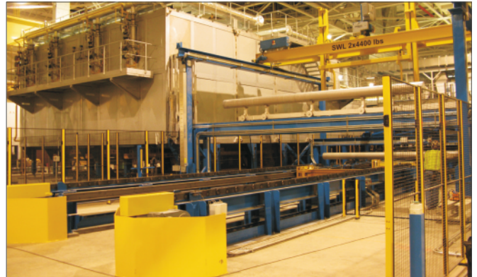
Continuous operating system

Unique reversing airflow designs and temperature control systems produce fast heating rates with close temperature uniformity throughout the entire load.