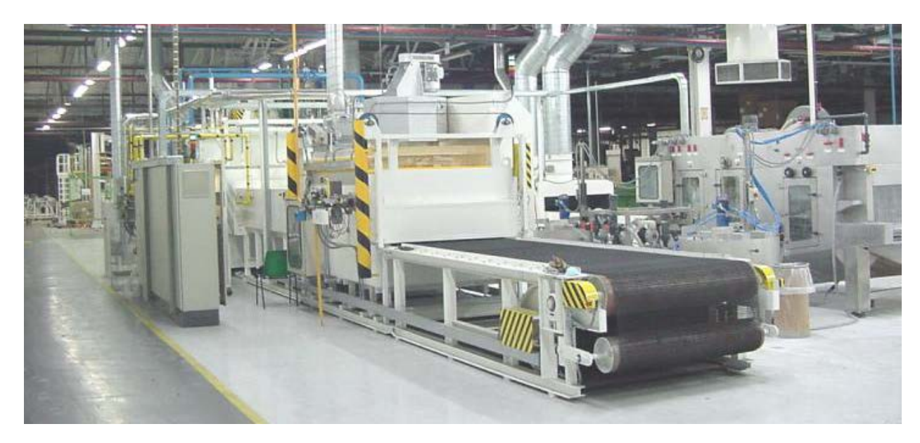
Figure 3 Mesh belt brazing system