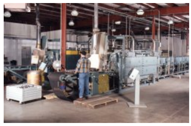
production line operations accepting parts Figure 1 - Mesh Belt Conveyor systems used for ready for heat processing and discharging copper brazing in commercial heat treat facility

Because the furnace can be utilized for many heat processes, it is widely applied for parts or assemblies used in volume production industries such as automotive, home appliance, electronics, aircraft and hardware.