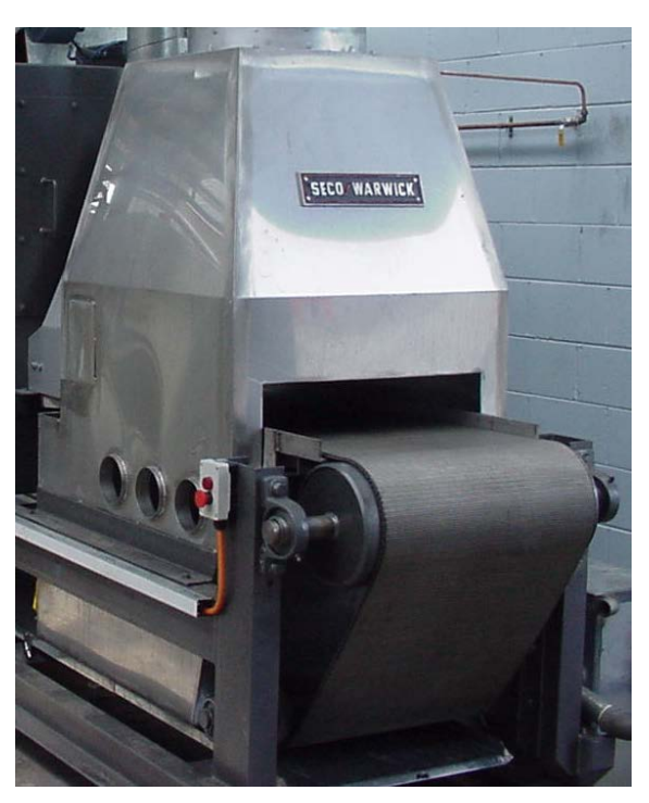
Figure 2 - Entrance chamber

A 10:1 ration variable speed drive unit with widely adjustable belt speeds allows the treatment of different thicknesses of materials with varying temperature requirements. The heat resistant nickel-chrome alloy belt is driven from the charge end of the furnace by a pinch roll, which presses the mesh belt tightly against a rubber covered drive drum. An idler drum at the discharge end of the furnace places tension on the belt to provide support throughout the return. Belt stretching is reduced since only a minimum tension is needed to pull the belt