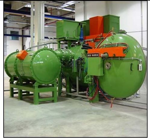
Fig. 4 Dewaxing/MIM vacuum furnace

A large majority of vacuum sintering furnaces are designed as a cold wall, front loading devices equipped with a vacuum pumping system, and equipped with an optional dewaxing system and gas cooling feature. Strong graphite insulation and heating elements provide long, reliable service in this heavy-duty furnaces designed for the industrial work place. Flat heating elements surrounding the load from all sides assure excellent temperature uniformity. The pumping system, power supply, cooling systems and dewaxing system are generously sized for sintering processes. The heater arrangement optimises temperature uniformity within the furnace hot zone. The cooling gas recirculation system includes a multi-nozzle gas feed arrangement to optimise the uniformity and rate of cooling of the load during quenching. The equipment is designed for easy maintenance and service operation. Users can reduce the cycle time to a minimum and save production costs.