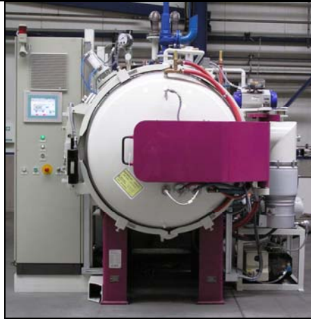
Fig.2 Dewaxing and vacuum sintering furnace

Control over heating rate, time, temperature and atmosphere is required for reproducible results. SECO/WARWICK offers different types of vacuum furnaces designed for different applications including: Dewaxing and vacuum sintering; High pressure vacuum sintering; Metal injection molding (MIM); and Outgassing.