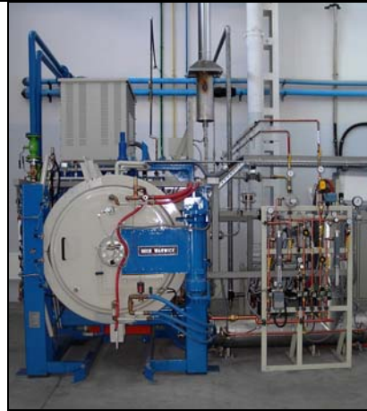
Fig. 3 "60 bar" overpressure vacuum, sintering furnace