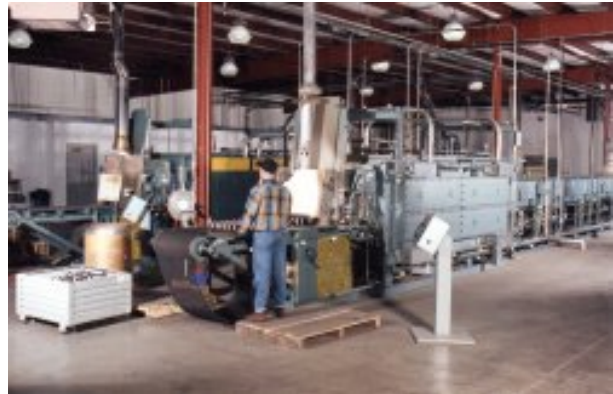
Figure 1 - Mesh Belt Conveyor systems used for copper brazing in commercial heat treat facility

Because the furnace can be utilized for many heat processes, it is widely applied for parts or assemblies used in volume production industries such as automotive, home appliance, electronics, aircraft and hardware.