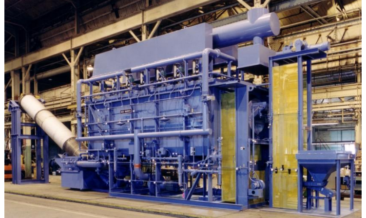
4,000 LB/HR (1,800 KG/HR) rotary retort system for annealing coin blanks

The rotary retort furnace can be built as a stand-alone quench hardening or annealing furnace with its metering loader and integral quench system, or part of a full harden-quench and draw line with tempering furnace, washer(s), atmosphere generator(s), analyzers, etc.