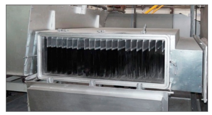
Strip foil curtain box