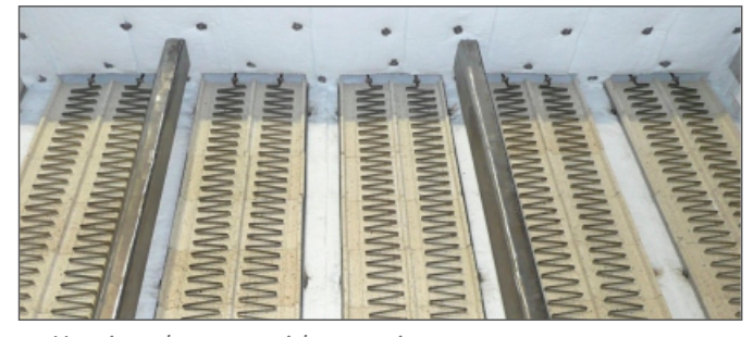
Heating elements with ceramic support