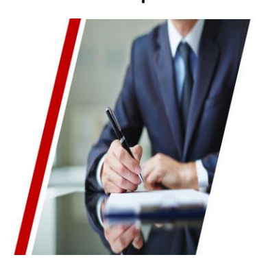
Q: "What's the difference between VAB and CAB?"