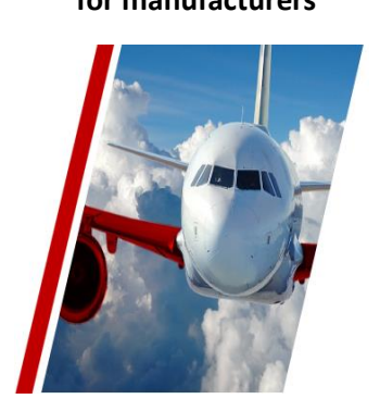
Development of aviation constitutes a challenge for manufacturers

Flying high: aviation industry places more and more orders