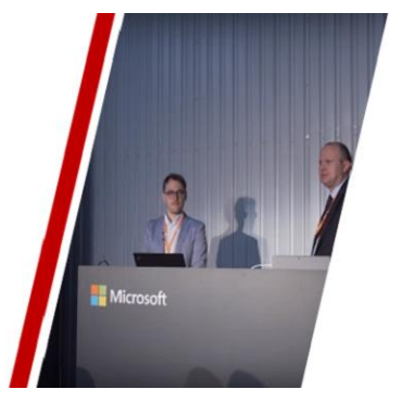
Setting trends, leveraging IT solutions & enhancing core business processes