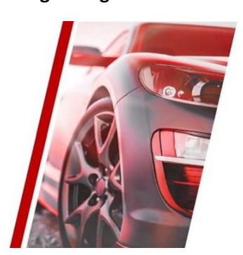
Electric vehicle adoption is growing worldwide

What it means for automotive component manufacturers