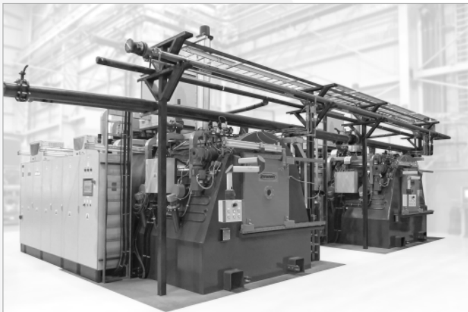
Case hardening CMe-T9912 – triple-chamber, LPC and oil quench

CaseMaster Evolution furnaces appear in two types: D and T. Type D is a double-chamber furnace, equipped with a heating/process chamber and a quenching chamber (available both: oil and gas) separated from each other and ambient conditions. It's a single batch-type furnace, one side loading, and unloading.