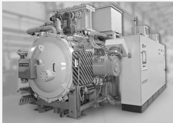
Case hardening CMe-D669-25 – double-chamber, LPC and 24 bar gas quenching

Combined with low process costs, shorter cycles, higher output and precise control over the process, they make the carburizing made in SECO/WARWICK highly competitive. The family of CaseMaster Evolution “CMe” vacuum furnaces is dedicated for batch and semi-continuous case hardening by low pressure carburizing LPC® and oil or gas quenching as well as for through hardening as a wide attractive alternative for atmospheric sealed quench furnaces, continuous lines and multi-chambers systems.