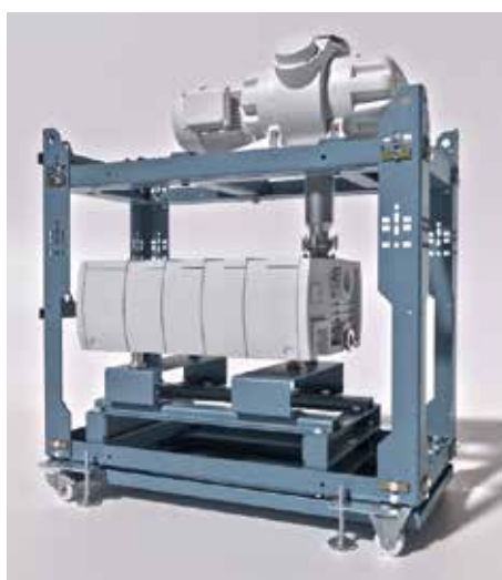
RUVAC WSU 501 / VARODRY VD 100 frame mounted version