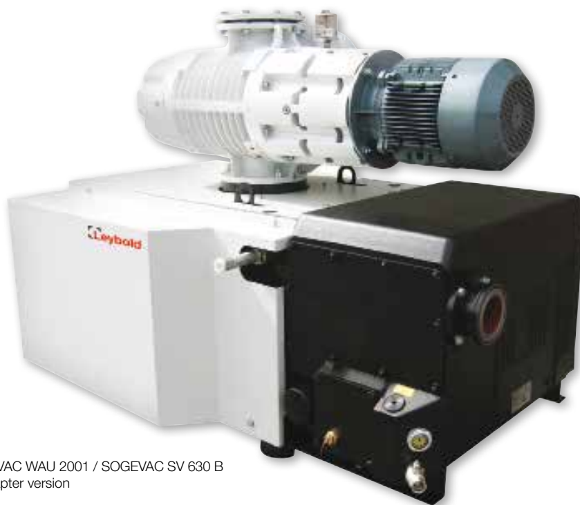
RUVAC WAU 2001 / SOGEVAC SV 630 B adapter version