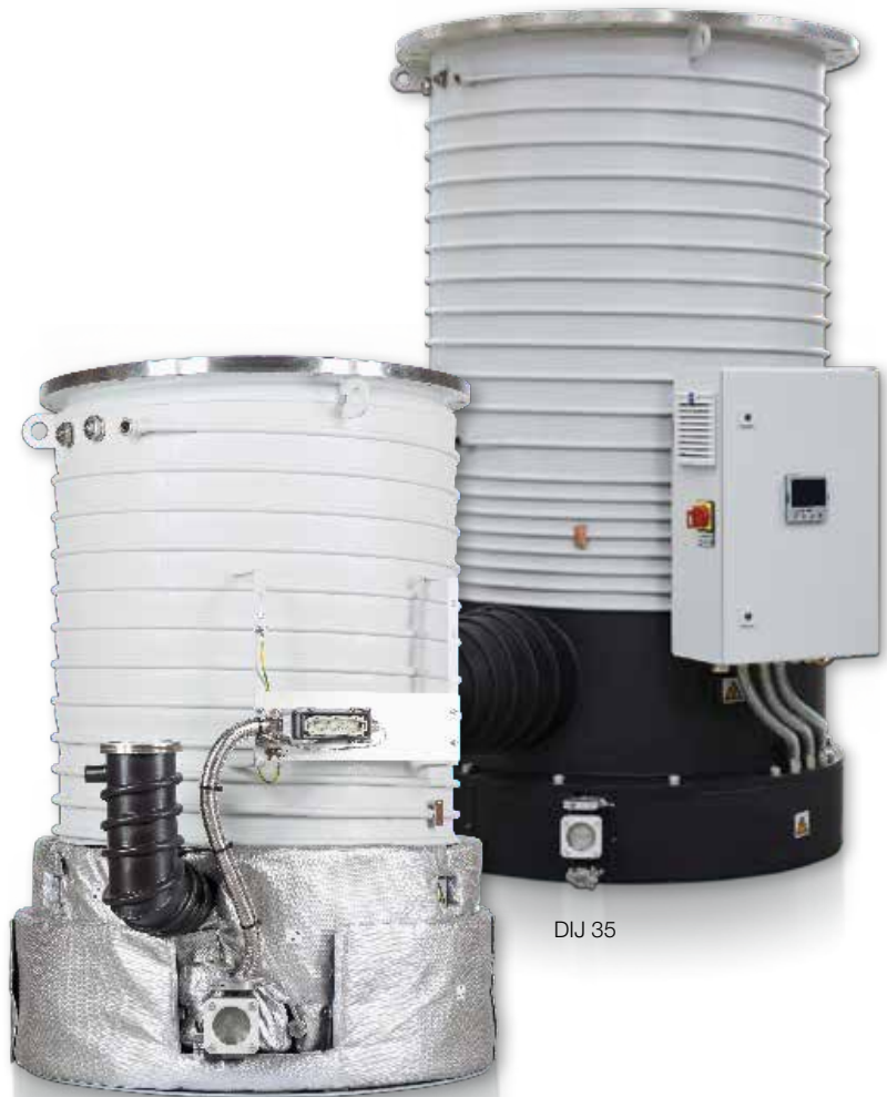
DIP 20 000 with thermal insulation