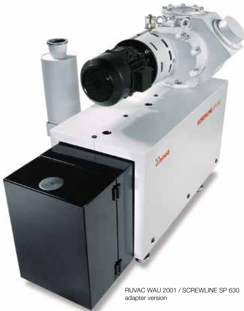
RUVAC WAU 2001 / SCREWLINE SP 630 adapter version