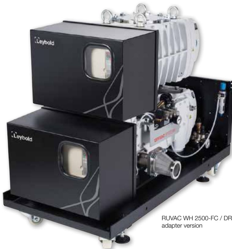
RUVAC WH 2500-FC / DRYVAC DV 650 adapter version

They are also preferred if end users want to minimize their maintenance demands.”