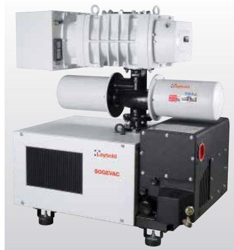
RUVAC WH 2500-FC / TwinFilter 500 / SOGEVAC SV 470 B adapter version

“Vacuum systems based on SOGEVAC rotary vane pumps deliver the best cost vs. performance ratio for the broad base of less demanding heat treatment applications”