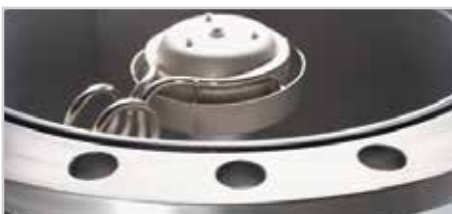
Diffusion pump cold cap baffle