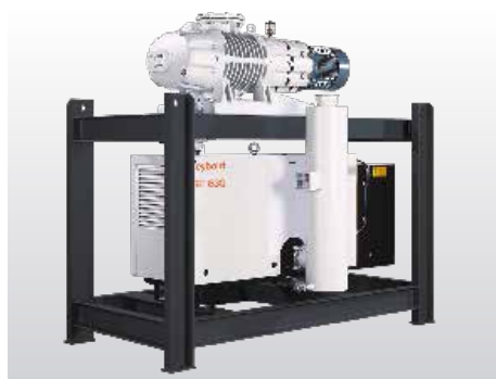
RUVAC WAU 2001 / SCREWLINE SP 630 frame mounted version

Paraffin binders evaporate without thermal decomposition. If their vapors enter the SCREWLINE SP, the internal temperatures of the pump are just in the right window to avoid build-up of layers by cracking and to keep the condensate in liquid phase. Paraffin binder vapors can be handled without any enhanced maintenance demand.