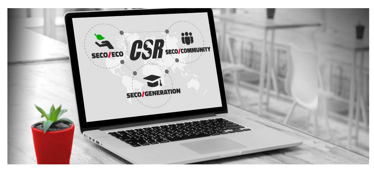
In 2022, SECO/WARWICK and its employees planted thousands of trees, pro bono designed and manufactured metal constructions for the State Fire Department and funded the ongoing SECO/HEARTS recycling program.

SECO/WARWICK, one of the world's largest companies manufacturing industrial heat treatment furnaces, constantly shows what socially responsible business means.