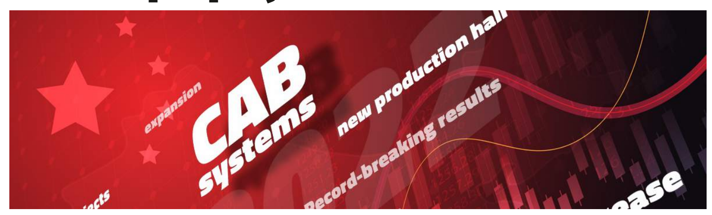
2022 was a breakthrough year for the SECO/WARWICK Chinese branch. The company started vacuum furnace production and executed 40+ projects.

Record-breaking results and dynamic development within the electromobility industry, which launched the EV/CAB technology designed to equip companies producing battery cooling plates for electric vehicles. These developments enable SECO/WARWICK China to dynamically increase employment and resulted in the delivery of the largest continuous CAB line in the company's history. These are only some of the milestones of the past Year of the Tiger. Sales of the flagship continuous CAB line solutions for aluminum brazing in a protective atmosphere, increased year-over-year by as much as 30%.